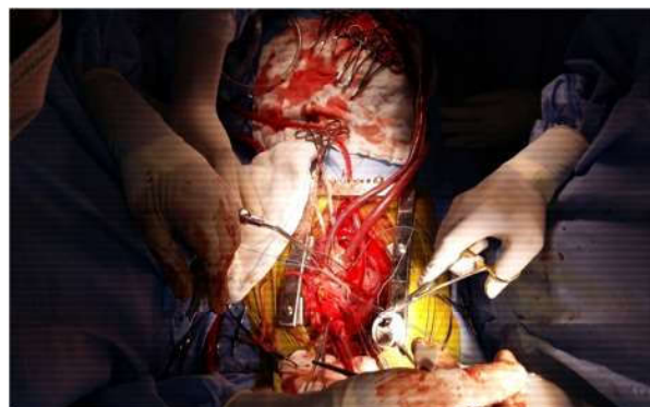
Fig. 1: Mitral valve replacement with mechanical prosthesis

We had 4 (211) Superficial Wound Infection - Superficial Sternal Infections (SSI) which was treated with local dressings and Antibiotics.