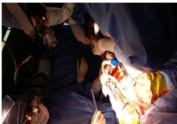
Fig. 5: Coronary Artery Bypass Grafting - Off pump surgery using octopus stabilizer